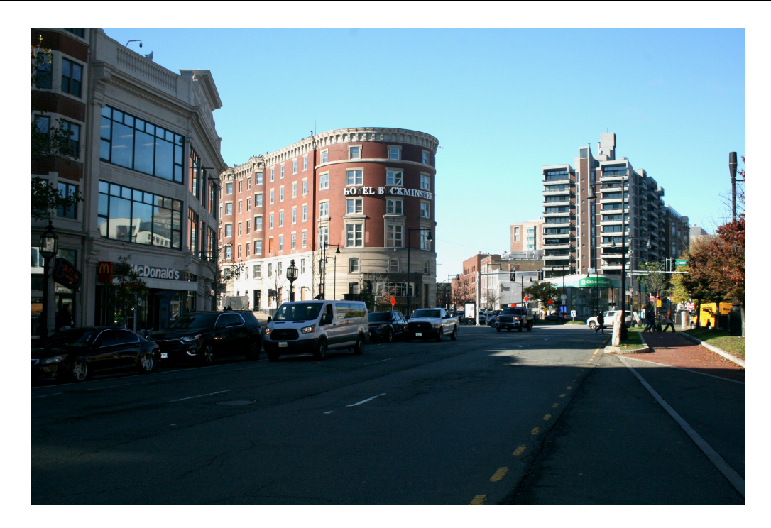
View west from Commonwealth Ave - Hotel Buckminster at center