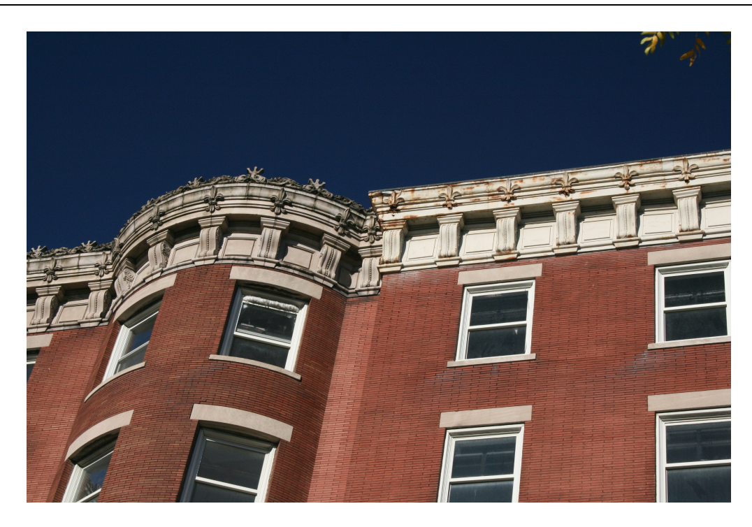
1897 (left) and 1902 entablatures