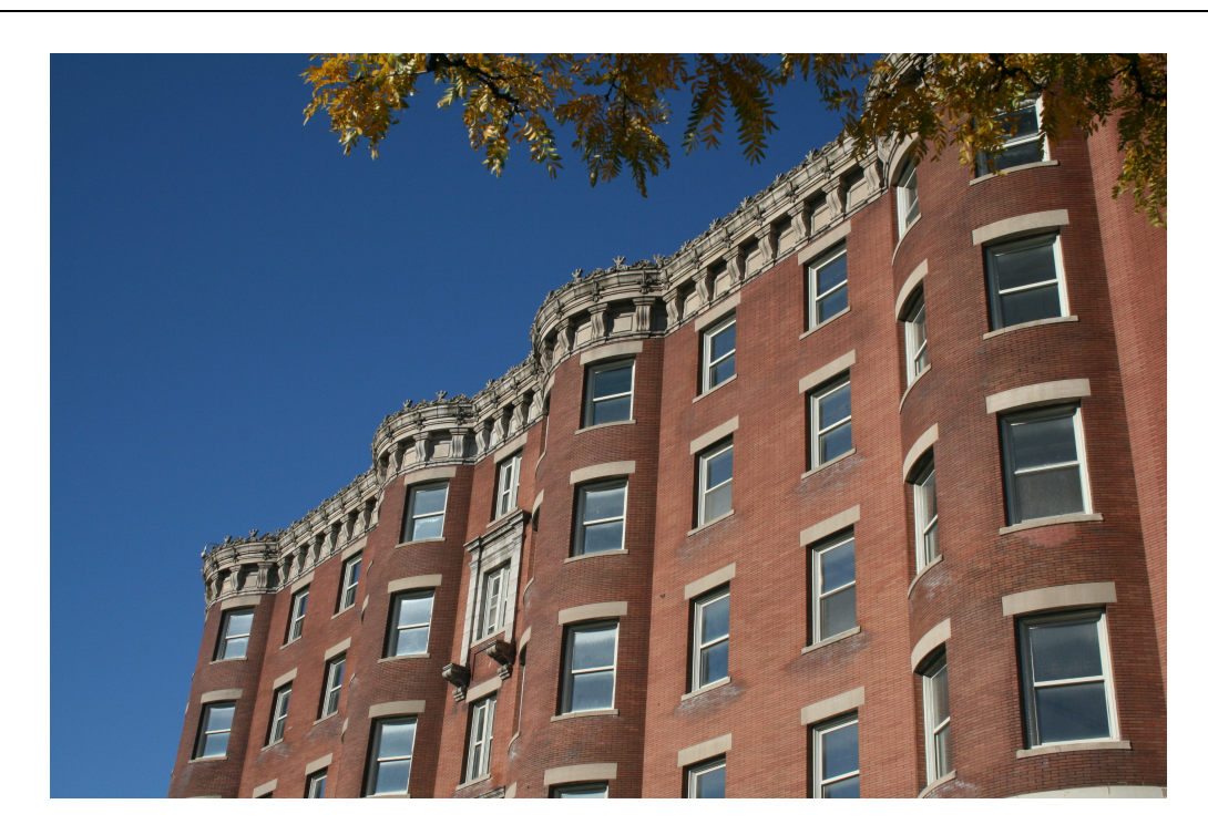
Brookline Ave elevation detail