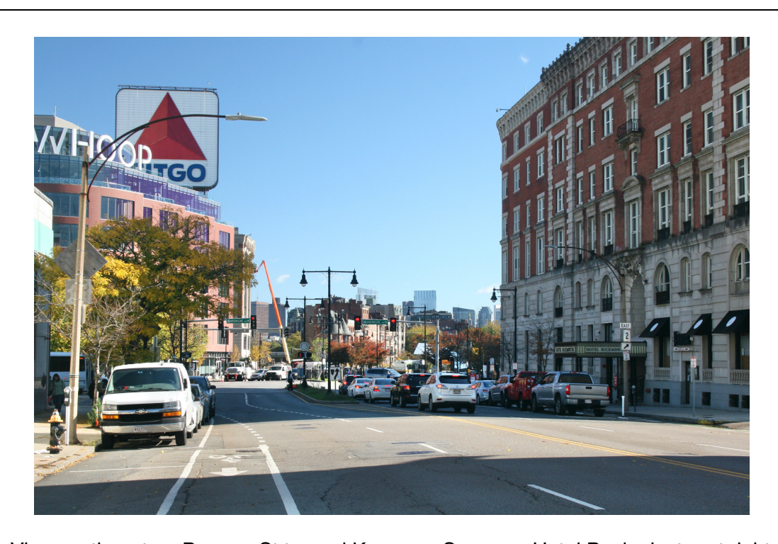
View northeast on Beacon St toward Kenmore Square - Hotel Buckminster at right