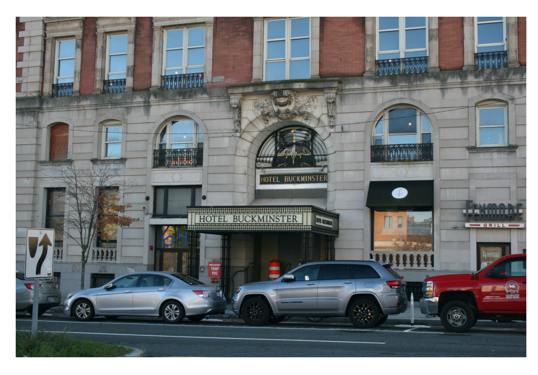
Beacon St façade – entry detail