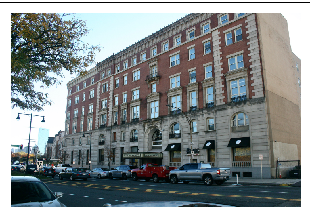
View east from Beacon St