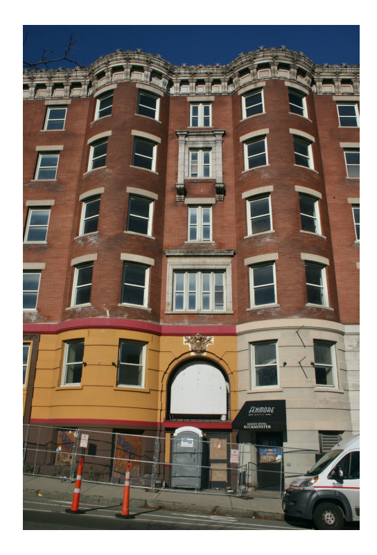
Brookline Ave elevation – entry bay detail with painted brick