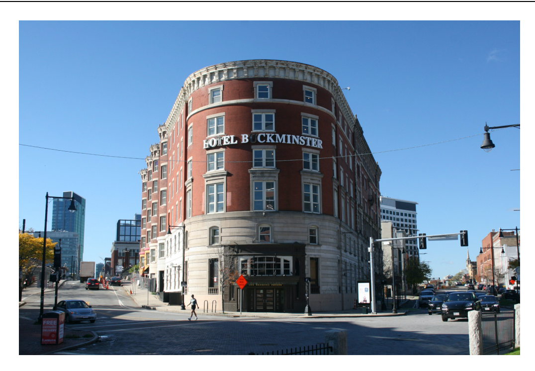
View southwest from Kenmore Square – Brookline Ave (left) and Beacon St (right)