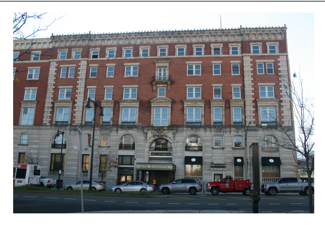
View southeast from Beacon St – façade of 1897 hotel block