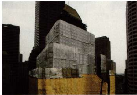
The Landmark is undergoing one of the most complete historic renovations in

The concept of Federal Center began with The Landmark, a 24-story office building now being renovated into first class office space. Completed in 1930, it was New England's first skyscraper and the headquarters for a leading corporation. The original architects created one of Boston's finest Art Deco treasures, now listed on the National Register of Historic Places.