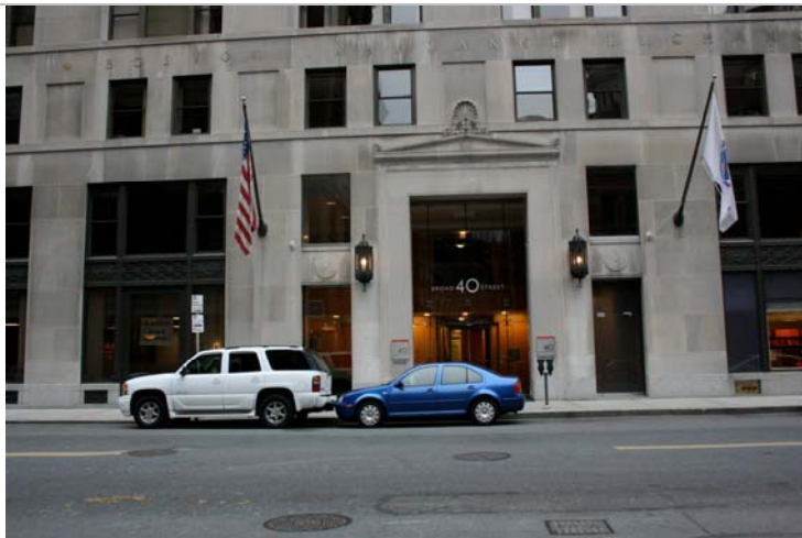
Ground floor detail – Broad Street