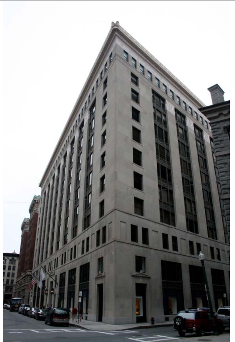
Broad Street (west) and Milk Street (south) facades